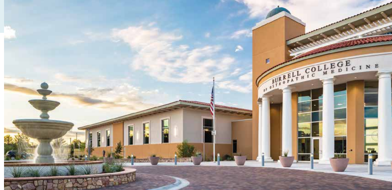
(Burrell College of Osteopathic Medicine: bcomnm.org )

The MCA exists to ensure that the health care needs of the Paso del Norte region are met by facilitating the growth of an entire "life sciences ecosystem"—from delivering health care education and training for our region's workforce to commercializing biomedical research and innovations. ( mcamericas.org )