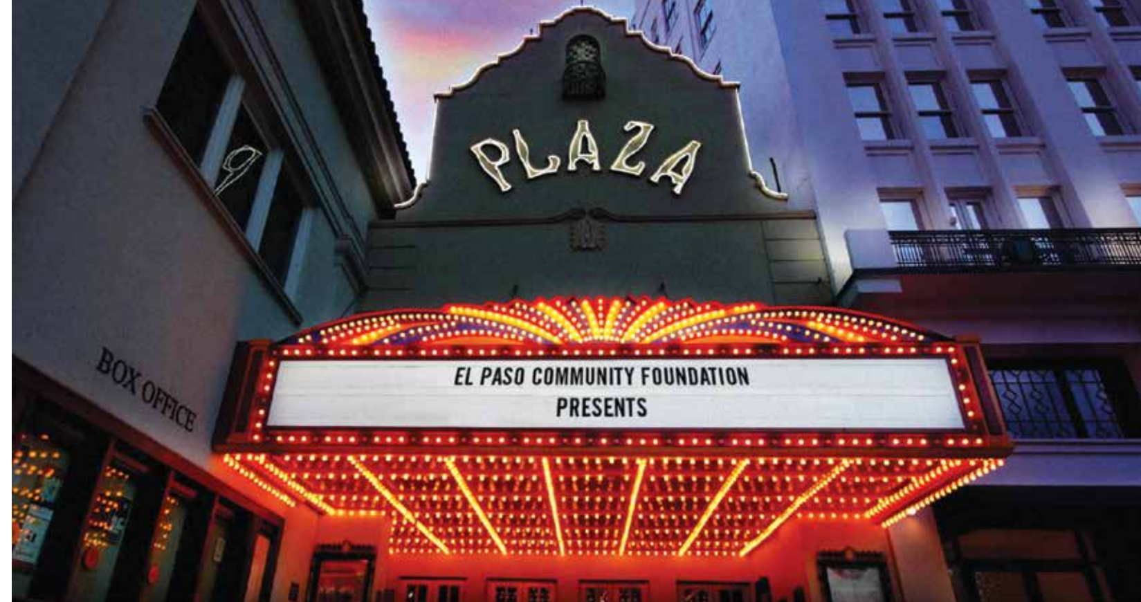
(Plaza Theatre: El Paso Live)

In the city's heart stands a hidden gem, a small white house full of color. Galería Lincoln is located at 3915 Rosa Ave. next to Lincoln Park and the freeway pillar murals Galería Lincoln was first established in early 2020 by