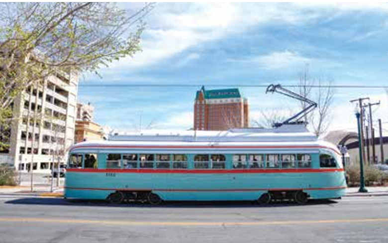
(El Paso Streetcar, @elpasostreetcar)

The El Paso streetcar system links the International Bridges, downtown retail areas, convention center, ballpark, Cincinnati Entertainment District, and the University of Texas at El Paso, among other area attractions. Approximately 4.8 miles of track, 27 streetcar stops, street improvements and a vehicle maintenance and storage facility near the existing Sun Metro Downtown Transfer Center. (crrma.org)