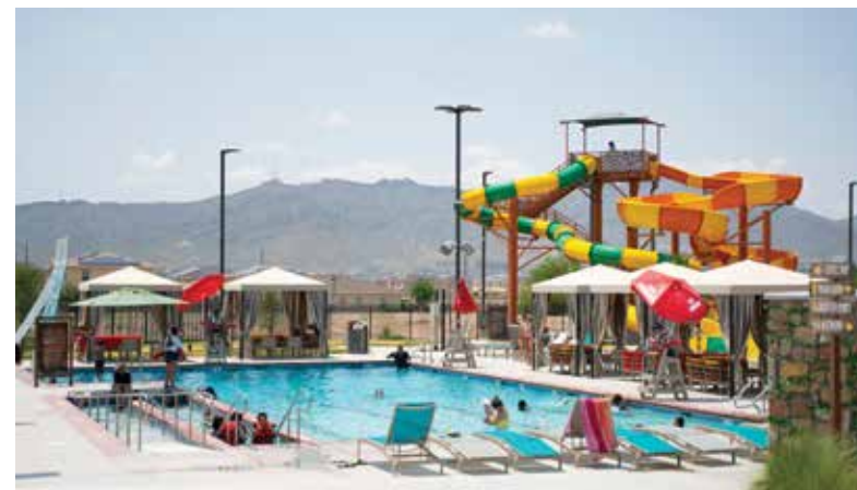
(Lost Kingdom Water Park, @EPWaterParks)

The El Paso Rhinos are a junior ice hockey organization based in El Paso, Texas. Their home games are played at the County Events Center located within the El Paso County Coliseum complex. The Rhinos are members of the South Division of the Tier III junior North American 3 Hockey League. In 2020, El Paso Rhinos won the Kraft Heinz Hockeyville USA contest and will get $150,000 for stadium renovations and host an NHL preseason game. ( elpasorhinos.com )