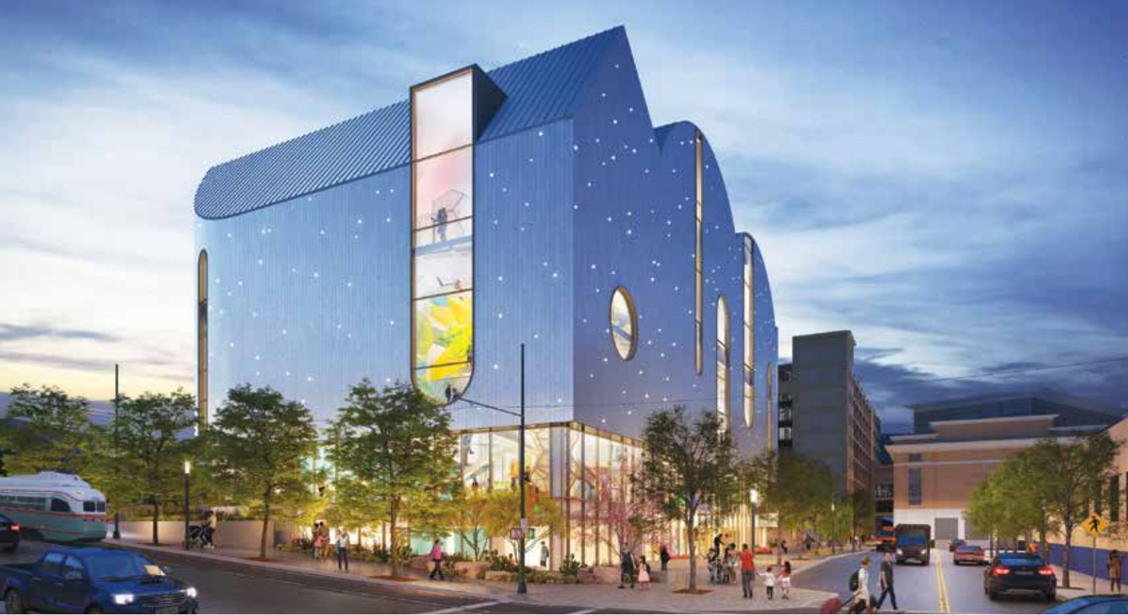
(La Nube rendering. Snøhetta/Moore )