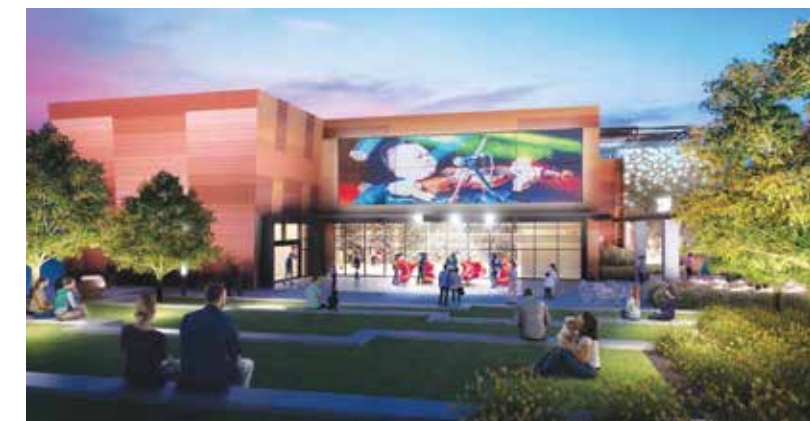
(MACC rendering, exigoarch.com)

Approximately 72% of El Paso voters approved the Mexican American Cultural Center (MACC) as one of three Signature Projects of the 2012 Quality of Life Bond. The Mexican American Cultural Center will provide residents and visitors with a dynamic space for the creation, exhibition and celebration of Mexican American art and culture. The MACC will be co-located at the El Paso Main Library in the heart of the El Paso Downtown Arts District and in close proximity to existing tourist and cultural amenities. (elpasotexas.gov)