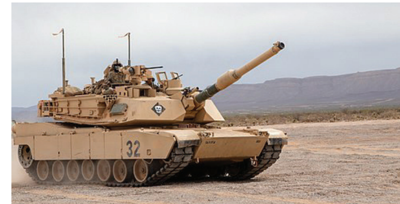
(M1 Abrams battle tank, U.S. Army photo by Spc. Matthew J. Marcellus)

Fort Bliss is home to the 1st Armored Division, which returned to US soil in 2011, after 40 years in Germany. Fort Bliss is comprised of approximately 1.12 million acres of land in Texas and New Mexico. Fort Bliss trained thousands of U.S. Soldiers during the Cold War. As the United States gradually came to master the art of building and operating missiles, Fort Bliss became more and more important to the country, and expanded accordingly. Fort Bliss is positioned with the best air, land and space capabilities, unmatched even by national training centers. Fort Bliss is the home of over 34,000 installation soldiers and was designed as the model army base for amenities for our soldiers and their family members. Fort bliss being is in the heart of El Paso where our members live, work, gain education and enjoy amenities within the city.