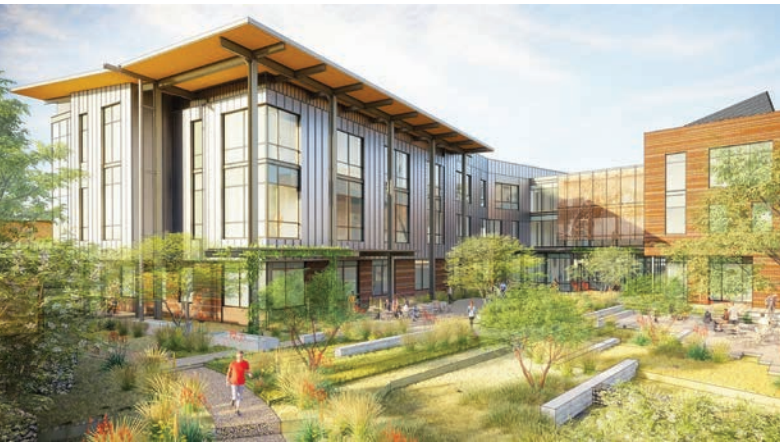
(Rendering of El Paso Water headquarters)

El Paso took a step toward becoming the country's hub for aerospace, defense, and advanced manufacturing on July 19, 2023, with the grand opening of the ELP Innovation Factory. The 30,000-square-foot facility, funded by a $40 million grant from the U.S. Economic Development Administration's Build Back Better Regional Challenge, is a collaborative effort between the University of Texas at El Paso (UTEP) and the City of El Paso. Manufacturers housed within the ELP Innovation Factory are selected based on their potential to have significant impact on expanded manufacturing capacity in El Paso and attract high-paying jobs. Once part of the ELP Innovation Factory, manufacturers receive technology innovation support and other services from UTEP's Aerospace Center and the W.M. Keck Center for 3D innovation. ( utep.edu )