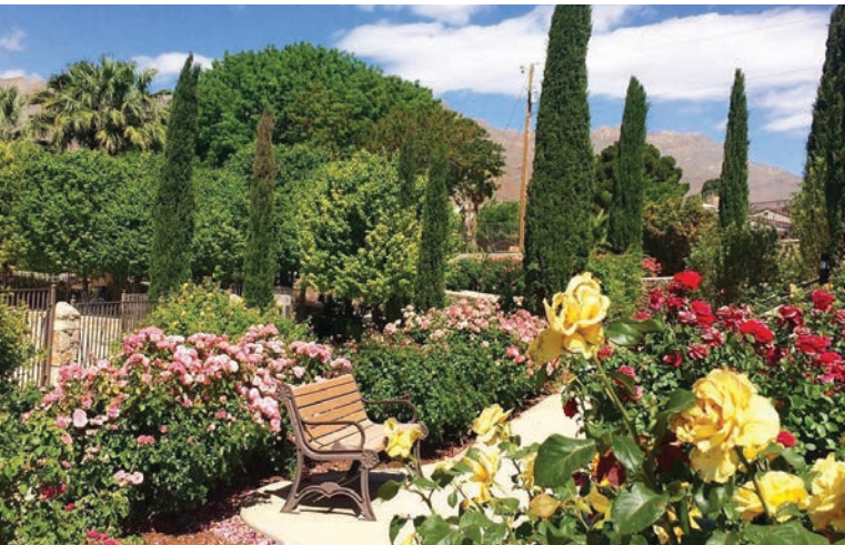
(El Paso Municipal Rose Garden,)

El Paso Locomotive FC is an American professional soccer team. Founded in 2018, the team made its debut in the USL Championship in 2019. Locomotive FC plays at Southwest University Park.