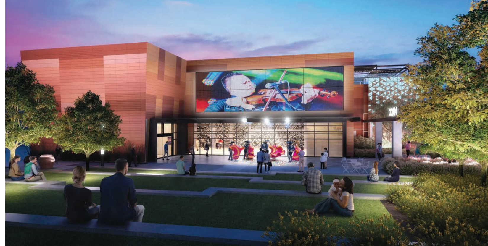
(Rendering of Mexican American Cultural Center, exigoarch.com )

Education Service Center Region-19's new Starlight Event Center in east El Paso was completed in January 2022 after 2 years of construction. The Starlight Event