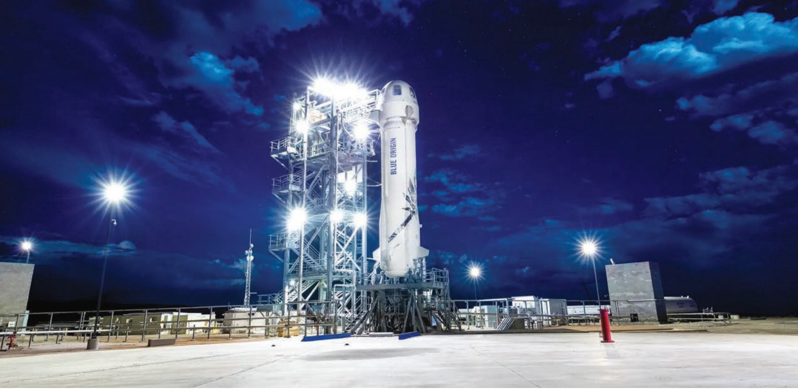
(Blue Origin's New Shepard suborbital vehicle)