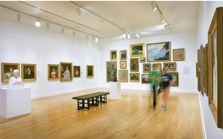
( El Paso Museum of Art, epmcad.org )