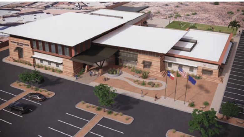
(The El Paso Veterans Wellness Center, endeavors.org )

El Paso opened its first and only not-for-profit dedicated children's hospital in 2012. El Paso Children's Hospital has served over 100,000 unique patients—one in two El Paso children. Specialty care and physician recruitment are on the rise. Children from all over the United States and foreign countries (including and outside of Mexico) now come to El Paso for specialty care.