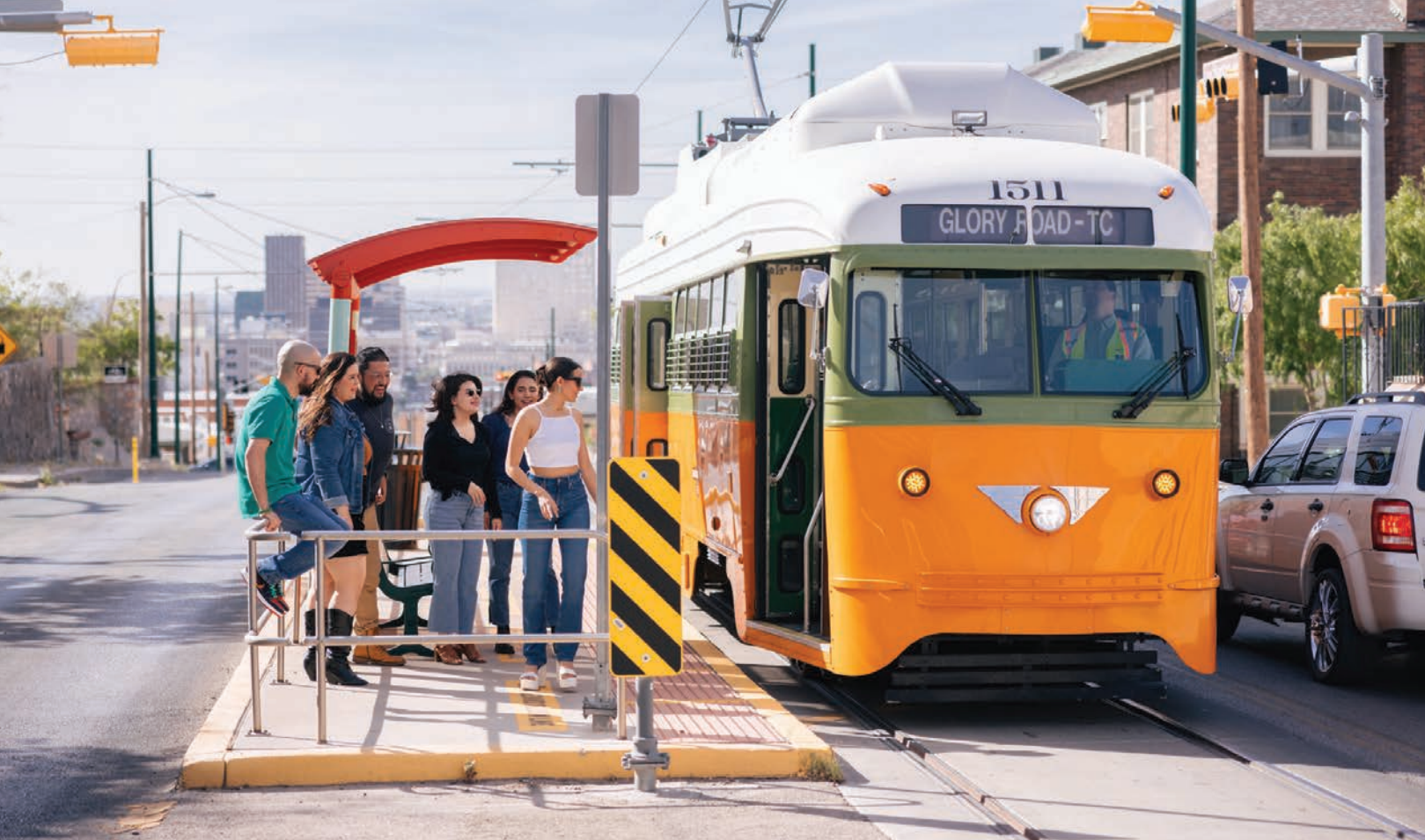
(El Paso Streetcar, facebook.com/elpasostreetcar)