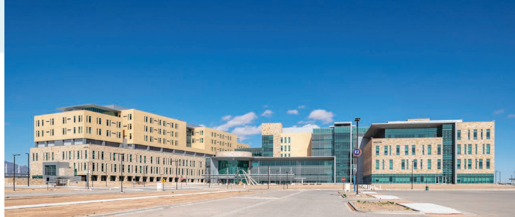
(William Beaumont Army Medical Center, hdrinc.com )

The Medical Center of the Americas Foundation is tasked with developing a growing hub of innovation for the Paso del Norte region's health care and biomedical industries.